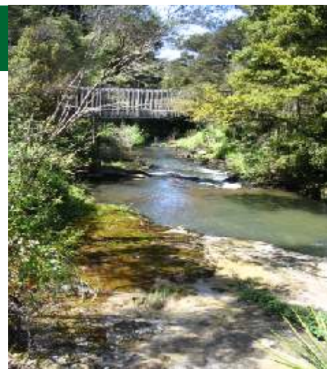
The footbridge over Hungry Creek

Extra materials/equipment up to $1000 depending on the student's major area of study.