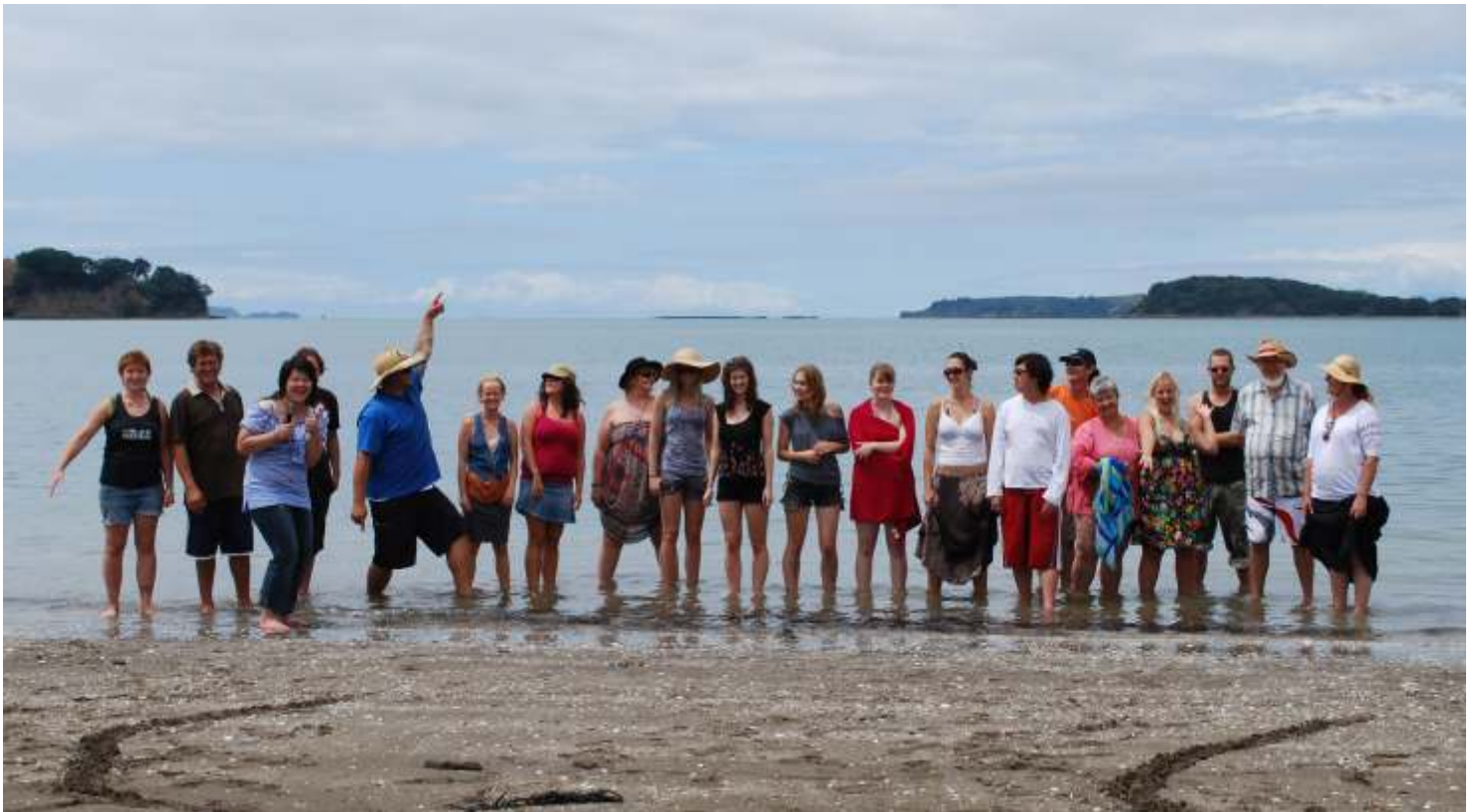
Orientation Day 2010. Sullivan's Bay, 5 minutes drive from the school

Certificate in Art & Craft (Foundation 1 year)