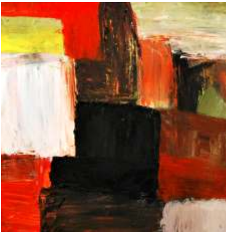
Russell Kim, Diploma in Art & Craft,(Advanced) Yr 4.

The painting programme is aimed at introducing students to the fundamental aspects of painting through the use of a variety of materials and subject matter. Students will be encouraged to develop individual expression and observational skills as well as the opportunity to question their own ideas and concepts.