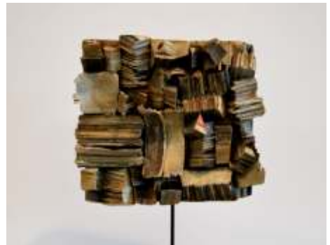
Flora Sekanova, Diploma in Art & Craft (Advanced) Yr4