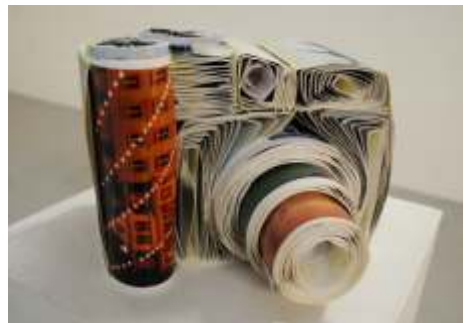
Elke Finkenauer, Diploma in Art & Craft Yr3