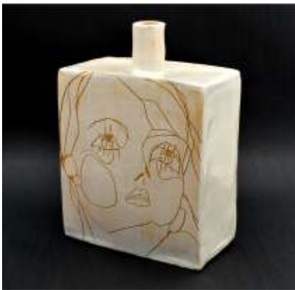
Waiata Riddell, Diploma in Art & Craft Yr2