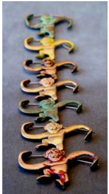
Gene Pospisil, Diploma in Jewellery Yr3

Covers a variety of skills required to manage a career in the arts, such as legal contracts (e.g. with galleries and dealers), photographing work, portfolio preparation, exhibiting and promotion, tax laws, funding, book keeping and teaching skills.