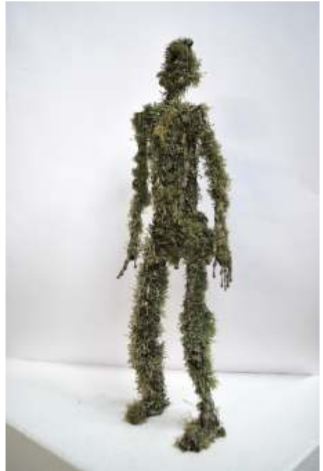
Raven Chapple-Scott, Diploma in Art & Craft Yr3

The North Shore Jewellery campus is situated in Albany close to public transport and every modern convenience of the Albany mall complex. The campus is sited in a tranquil bush retreat with a community atmosphere. It is only 10 minutes travel to Auckland city galleries & exhibitions. The jewellery qualifications are offered at this campus.