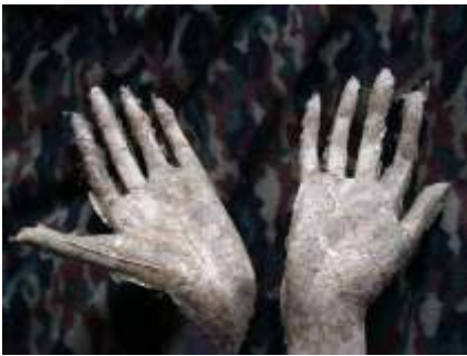
Raven Chapple-Scott, Diploma in Art & Craft Yr3

Students will learn to use both traditional and modern sculpture techniques, materials and modes of expression. The programme covers a range of materials including clay, plaster, wood, stone, metal and non traditional materials. Senior students are encouraged to experiment with a variety of materials and processes and to develop an individual response to 3D art making.