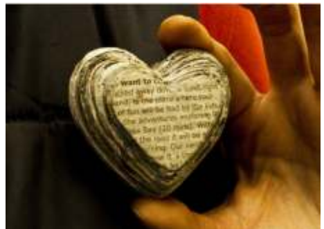
Flora Sekanova, Diploma in Art & Craft (Advanced)