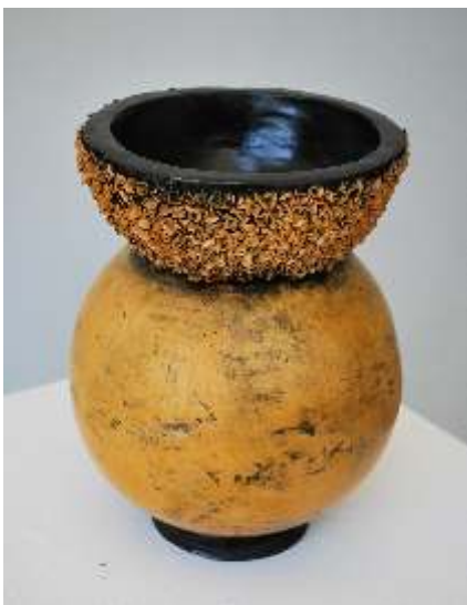
Ria Erasmus-Kruger, Diploma in Art & Craft Yr2